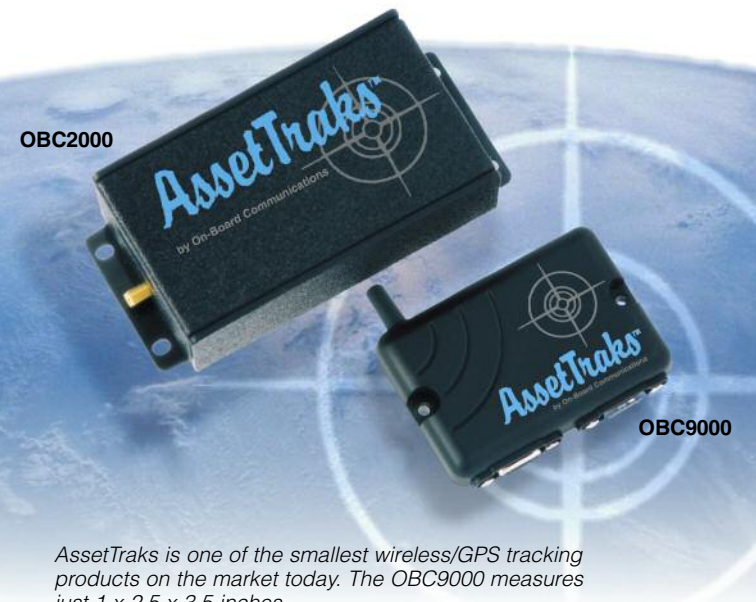
AssetTraks is one of the smallest wireless/GPS tracking products on the market today. The OBC9000 measures just 1 x 2.5 x 3.5 inches.